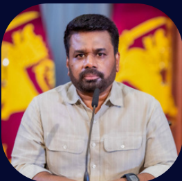
President of Sri Lanka